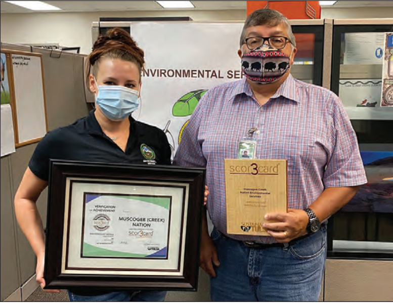
Muscogee (Creek) Nation Environmental Services achieved the Platinum award for Sustainable Tulsa.

For energy, environmental's office building has a new air conditioner but they are trying to conserve a little energy by turning things off. Before leaving they turn off their computers and lights in restrooms or offices. The transportation part they have two hybrid