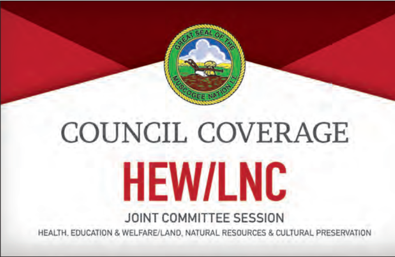
A Muscogee (Creek) Nation National Council Health, Education and Welfare and Land, Natural Resources and Cultural Preservation Committee meeting was held Aug. 25 by teleconference.