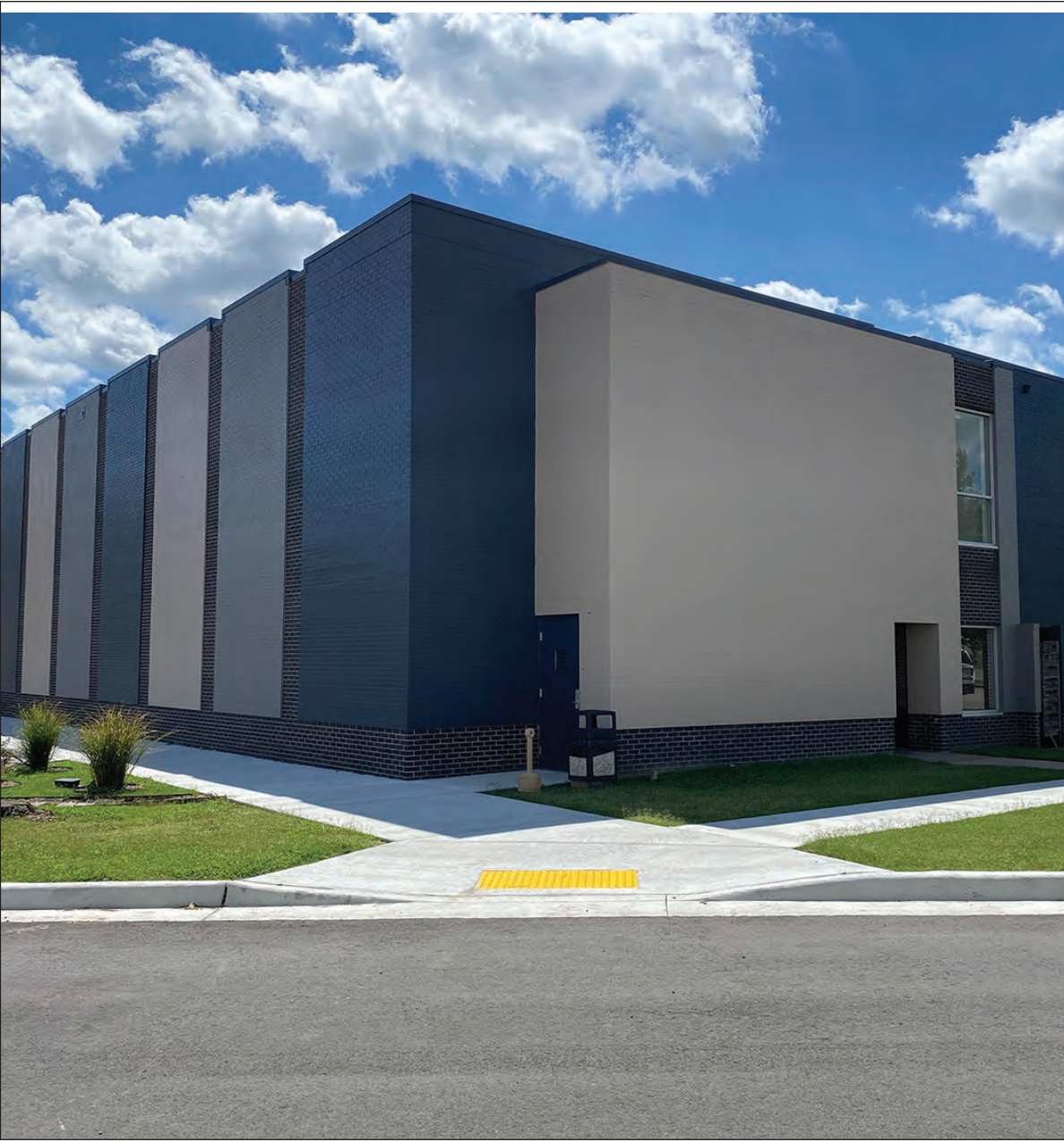
The MCN health facilities will be getting a new look on the Okmulgee Medical Center campus. The Okmulgee Clinic Annex exterior walls pictured above was recently painted.

In the medical center twelve new beds will be added to the second floor on 2 East and