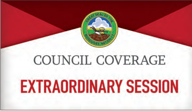
A Muscogee (Creek) Nation National Council Extraordinary meeting was held Sept. 1 at the Mound Building in Okmulgee, Oklahoma.