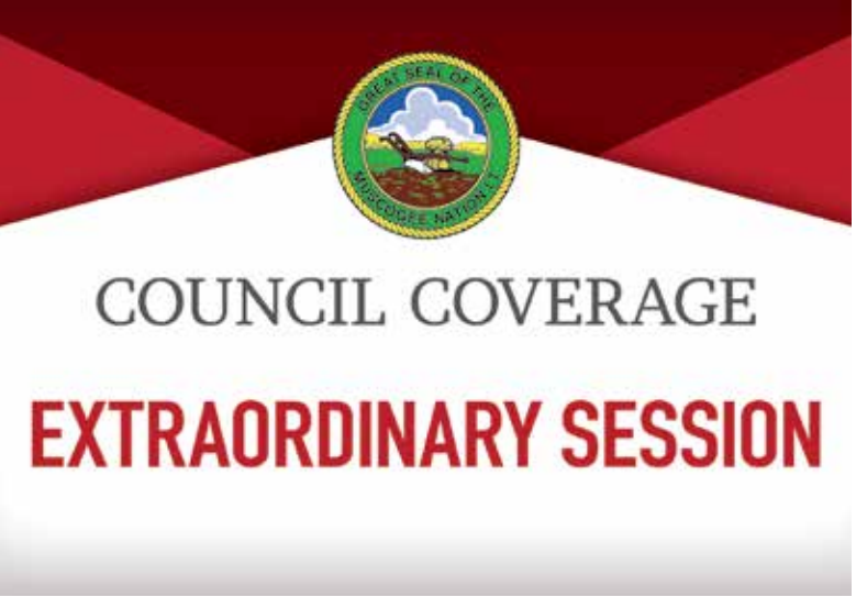
Contracts approved in Extraordinary Session.