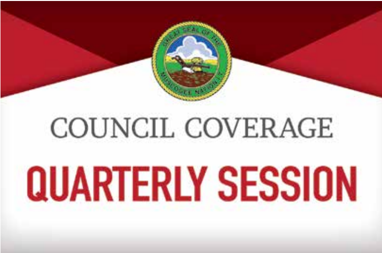
National Council approves judicial changes and executive branch access to records legislation.

TR 21-061 Resolution of the MCN authorizing the Principal Chief to execute a Programmatic Agreement among the U.S. Army Corps of Engineers, Savannah District, the Advisory Council