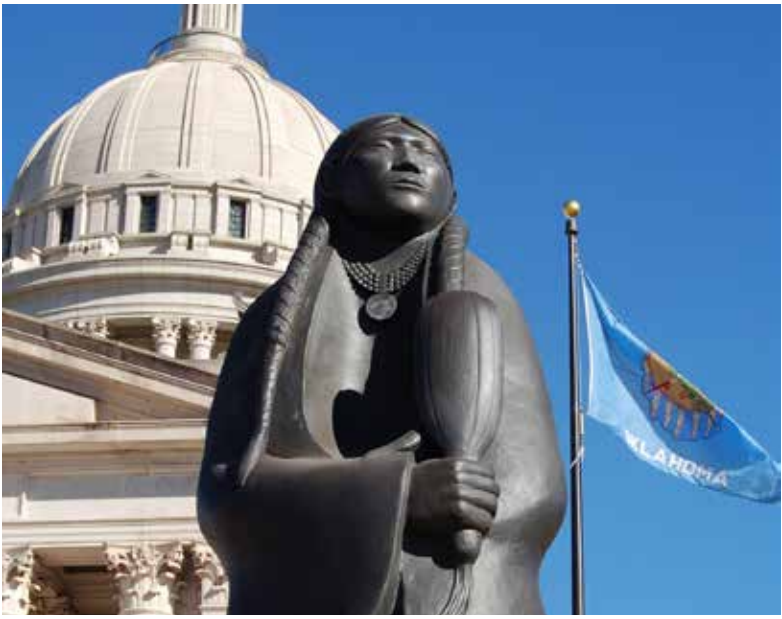
Oklahoma officials from both houses vote in support of Ida’s Law.