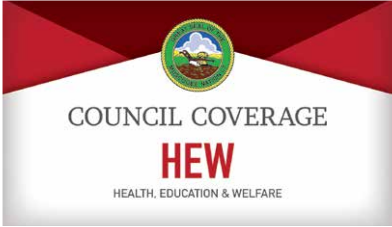
A Muscogee (Creek) Nation National Council Health, Education and Welfare Committee meeting was held April 14 at the Mound Building in Okmulgee, Oklahoma.