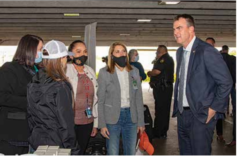
Governor Kevin Stitt is pictured speaking with Muscogee Nation’s FVPP during the “A Community Day of Hope” event.