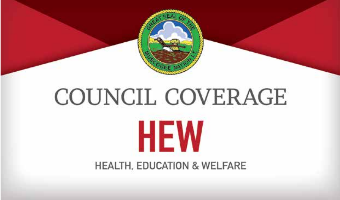
A Muscogee (Creek) Nation National Council Health, Education and Welfare Committee meeting was held June 9 at the Mound Building in Okmulgee, Oklahoma.

TR 21-087 Execute a certain agreement between the Muscogee (Creek) Nation Department of Health and