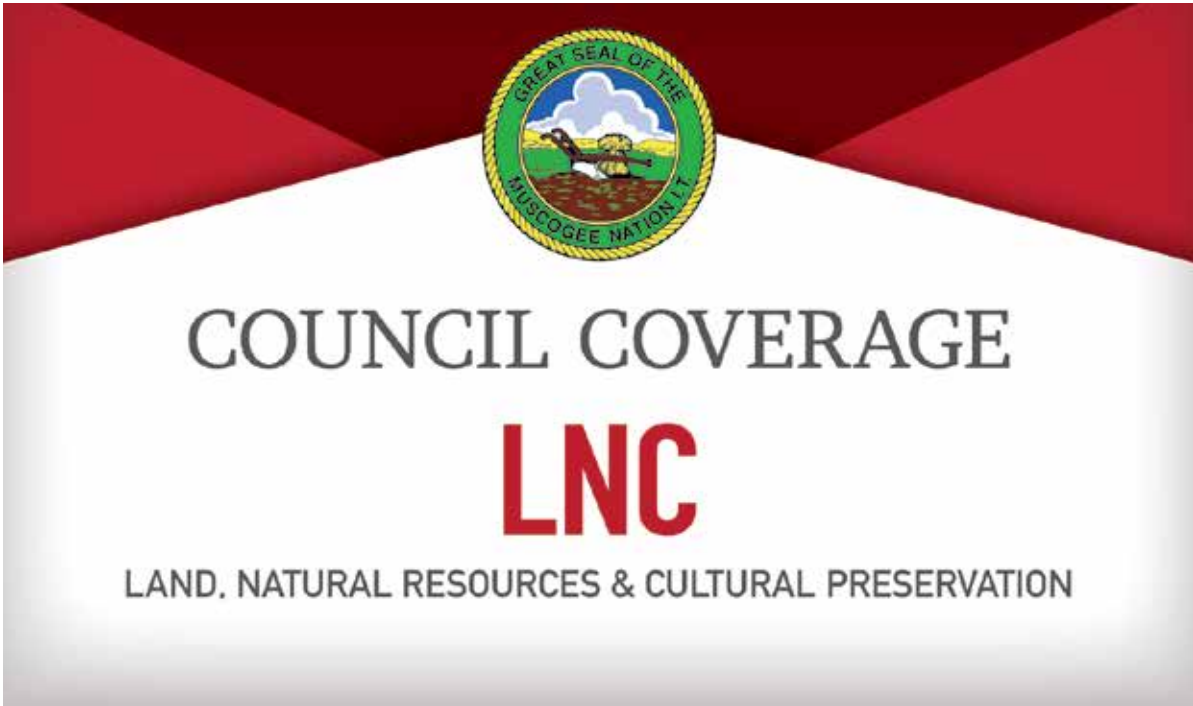
Forty homes throughout the Nation will receive needed updates.