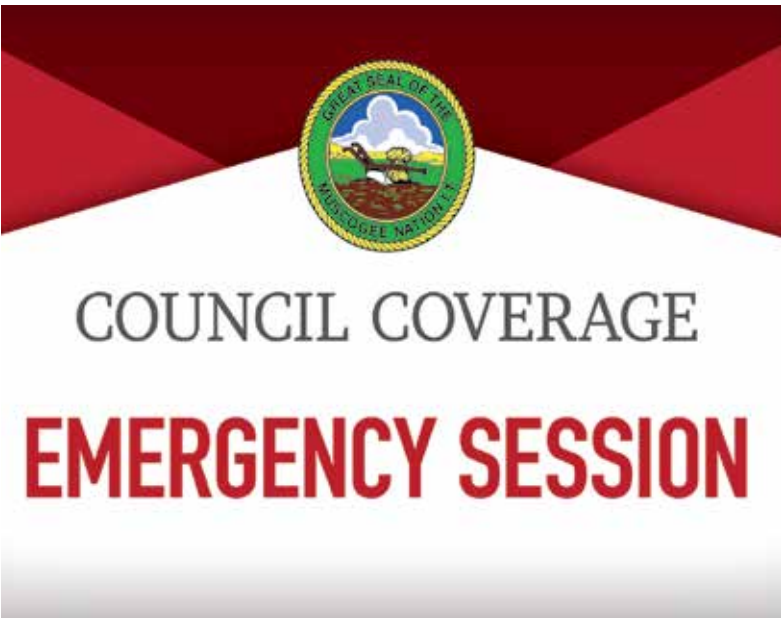
Meetings return to at the Mound.