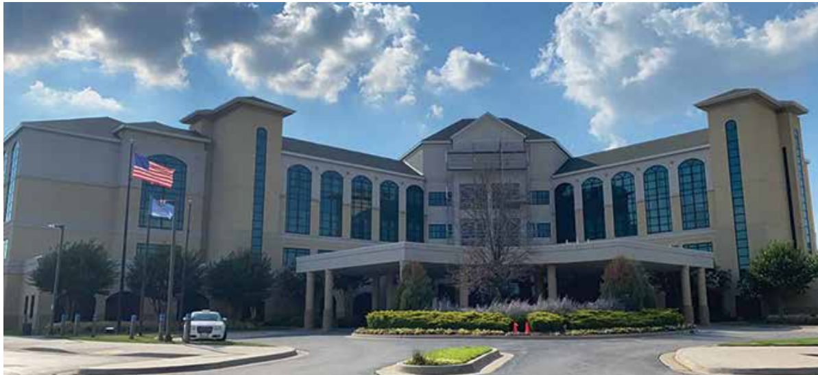
The Muscogee Nation to consider purchasing the former Cancer Treatment Centers of America facility in Tulsa for community hospital conversion. (Submission)