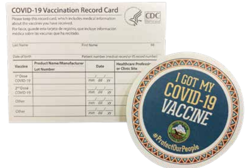
MCNDH is now offering the Pfizer vaccine to those from 12 to 15 years of age.