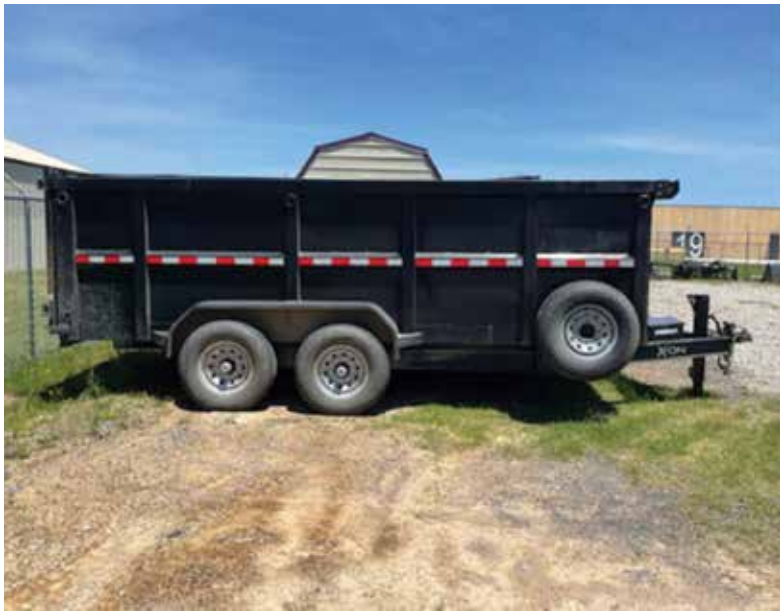
Lighthouse searching for stolen government property and urging citizens to report information. (Submission)