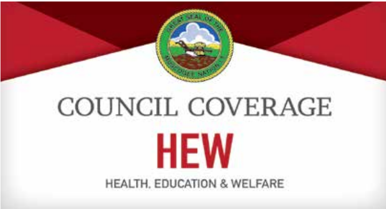
A Muscogee (Creek) Nation National Council Health, Education and Welfare Committee meeting was held June 26 at the Mound Building in Okmulgee, Oklahoma.

The Disaster Assistance program assists households