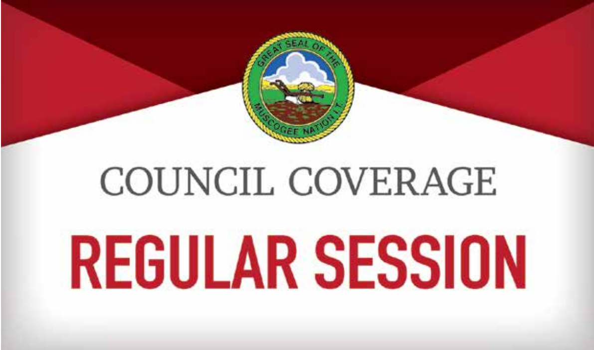
Confirmation of Kaila Harjo for cabinet position Secretary of Education, Employment and Training.