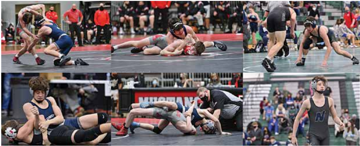
Belford twins take on competitors to win at the state meet. (Submission)