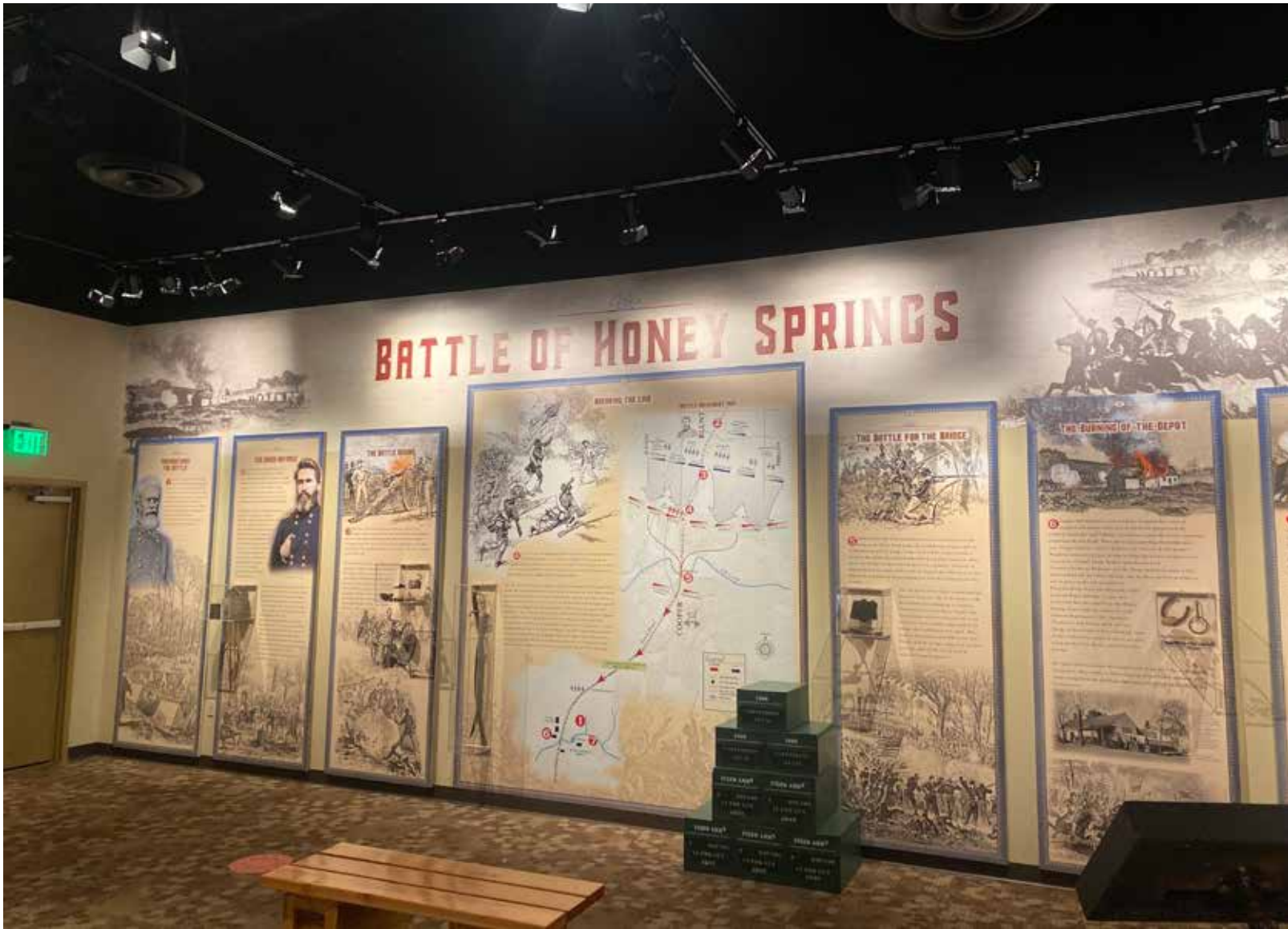
The largest Civil War battle to take place in Indian Territory on Mvskoke lands will be commemorated on July 17. For more information regarding the memorial service and Honey Springs Battlefield, please email alynn@okhistory.org or call 918-473-5572.