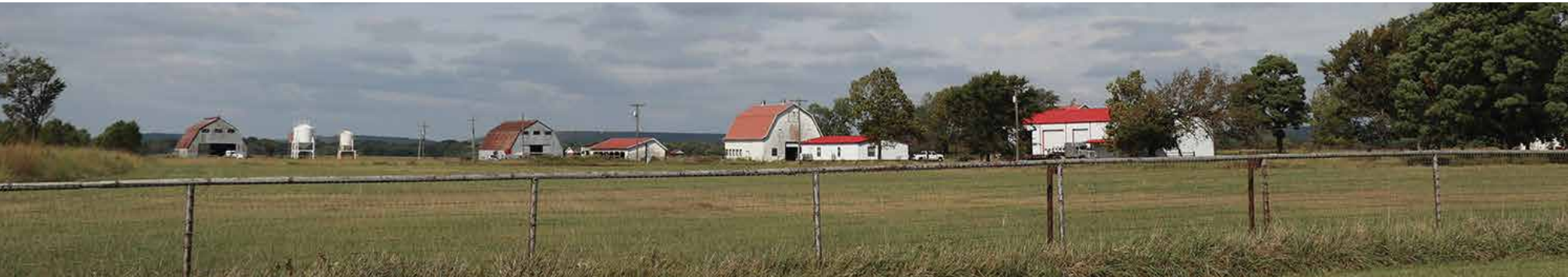
The Looped Square Cattle Ranch is located on Prairie Bell Road just east of Okmulgee.