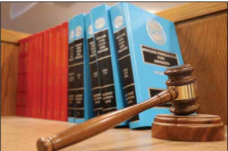
A hearing was held Oct. 8 to address petitions filed regarding the 2021 Primary Election.