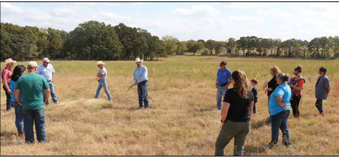
Citizens and local community members gather at locally owned properties for Plant ID Field Day.