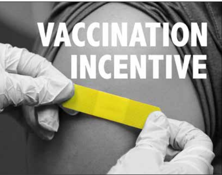
Muscogee Nation is now offering a one time incentive for vaccinated citizens.

Mvskoke Media will have ongoing coverage in this developing story.