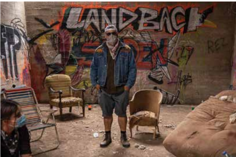
Sterlin Harjo director of “Reservation Dogs”