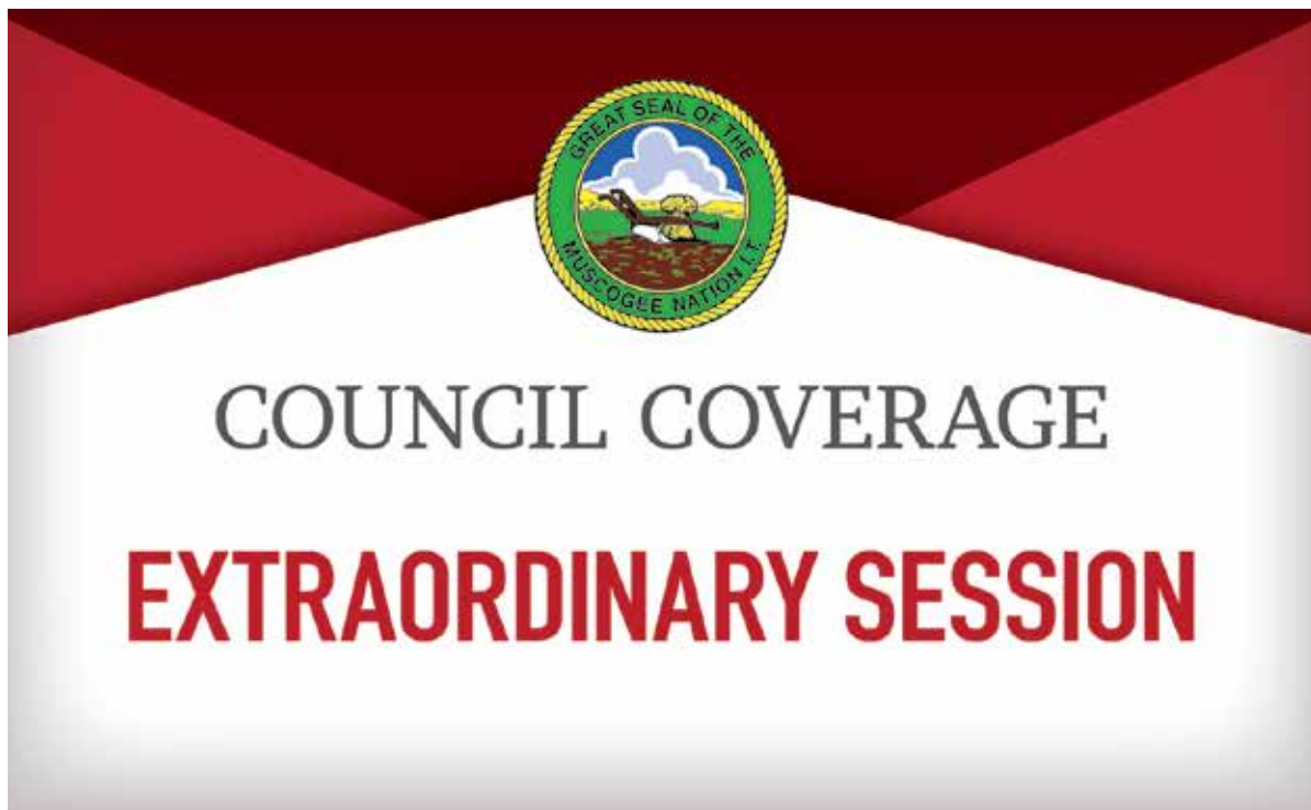
The Muscogee (Creek) Nation National Council held an Extraordinary Session December 27 via teleconference.