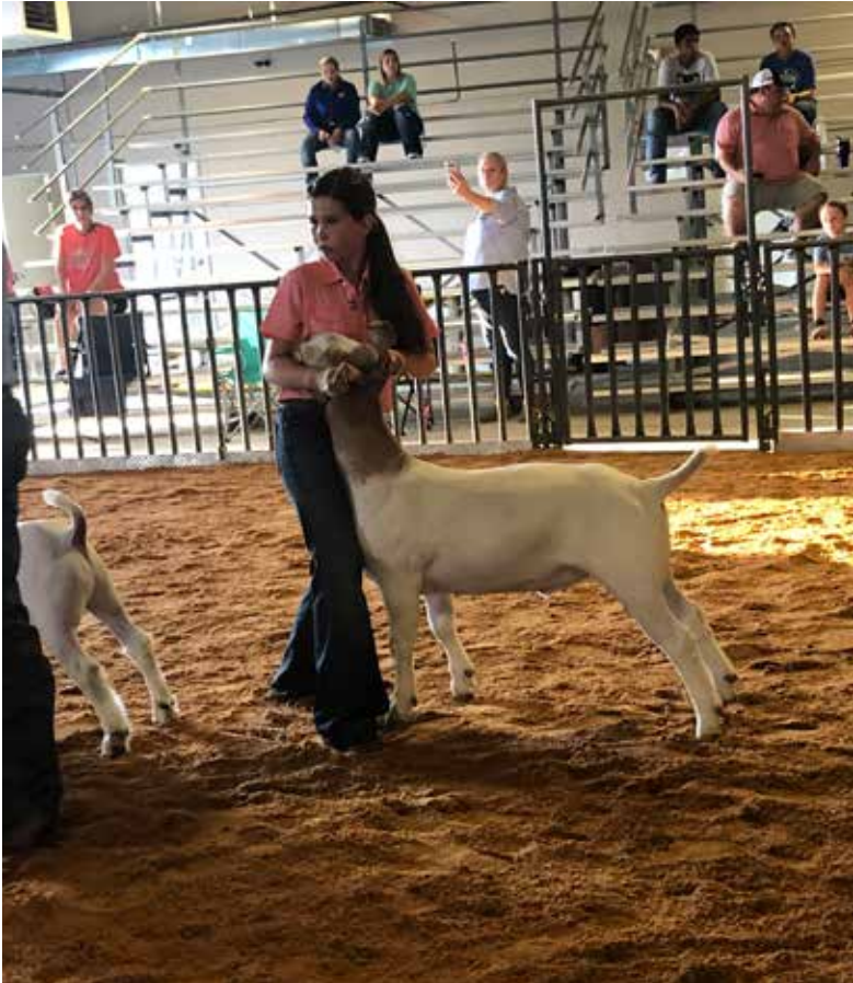
The event will take place during the last weekend of January on the 28th-30th at Okfuskee County Fairgrounds, 999 E Columbia St. Okemah, OK. (Submission)

For updates on future outreach events and information on how to register to vote as a Muscogee (Creek) citizen follow MCN Election Board on their Facebook page or call their office at: 918-732-7631.