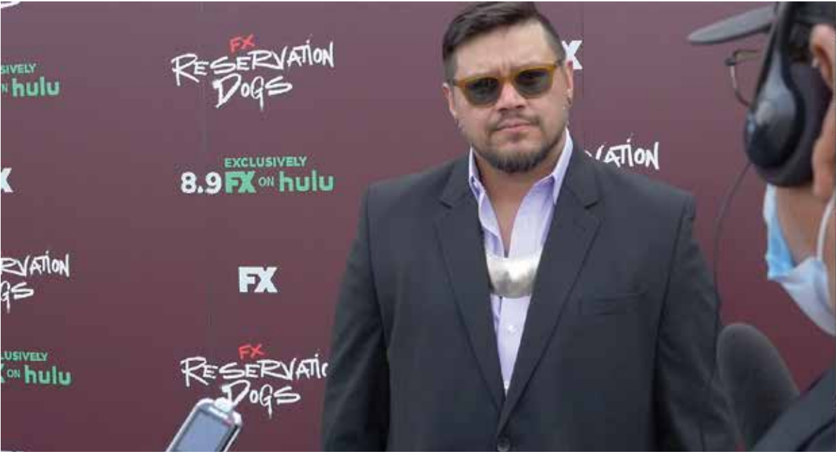
Native communities experience higher rates of suicide compared to all other racial and ethnic groups in the U.S.

As tribal communities are aware of the role that suicide plays in communities and the impact amongst Native youth, the depictions and storytelling