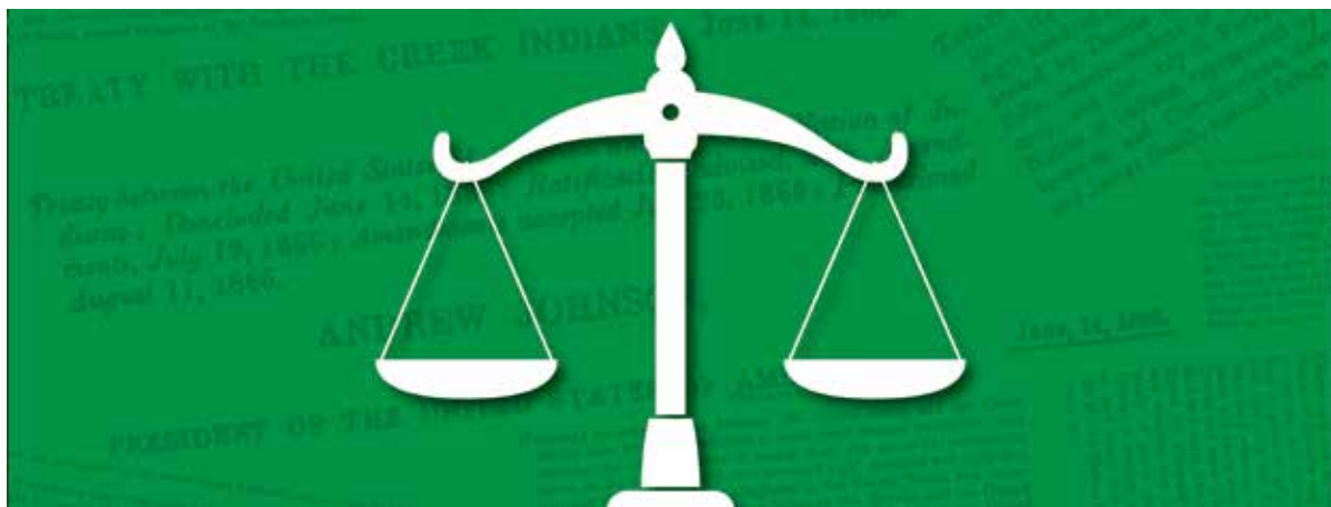
The state of Oklahoma has filed for writs of certiorari in 48 cases with the U.S. Supreme Court.

The Justices then hold a conference to discuss whether to grant or deny certiorari for the cases. If certiorari is granted, the case is heard, if it is denied, it is not and any cases that a