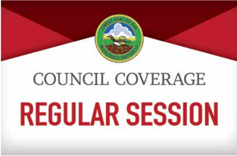
The meetings are now being conducted in-person at the Mound Building. (MM File)

of grant funds awarded from the U.S. Department of Justice Office on Violence against Women for the benefit of the Family Violence Prevention Program. Rep. Marshall sponsored the legislation, which was adopted 14-0.