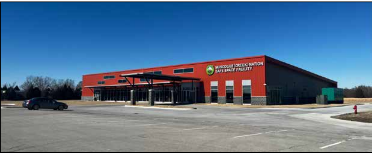
The Okmulgee site is currently housed in the Safe Space Building behind the Dome. (MM File)

In her new role with the Tax Commission, Edwards deals with licensing, collecting taxes on sales,