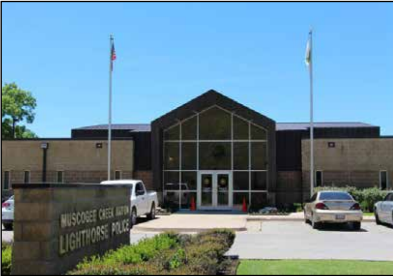
Lighthorse Police provides law enforcement agencies within the jurisdiction to join agreements for a collaborative working venture.

"With these agreements in place the Lighthorse officers don't need to