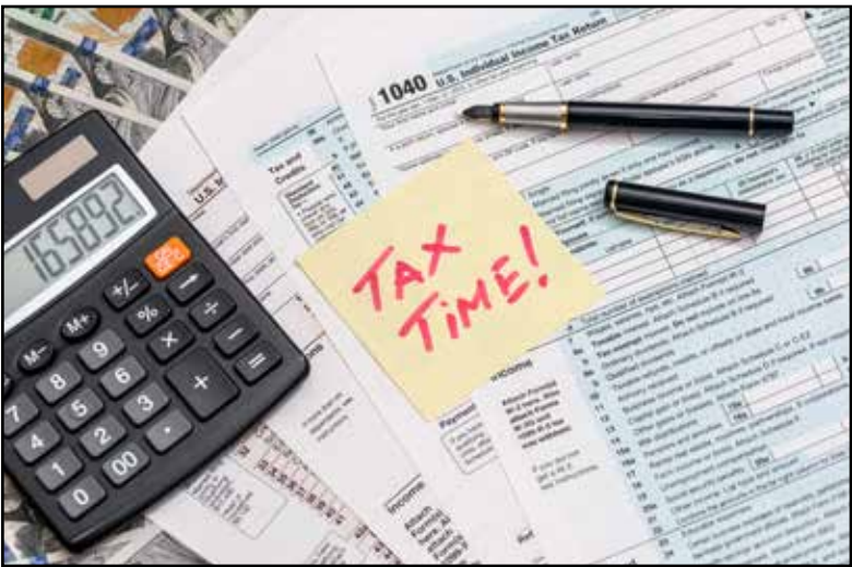
The VITA-TCE Tax Program is now available for free tax filing assistance to most qualifiers.