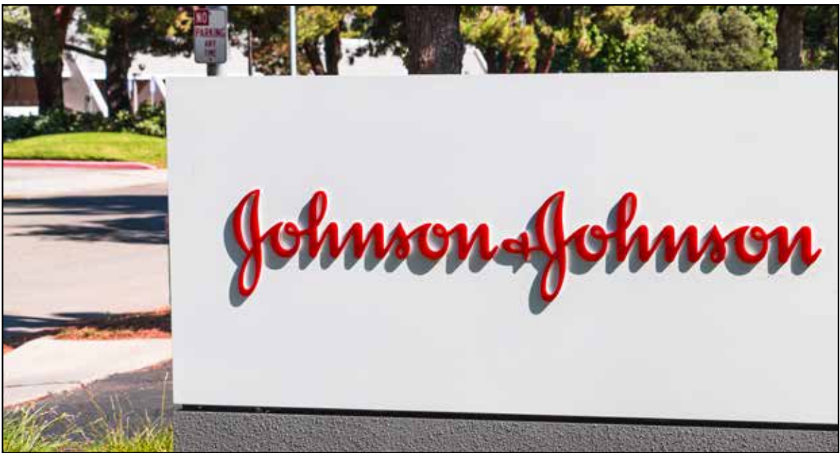
Johnson and Johnson settle on $590 million to pay U.S. tribes' opioid claims.