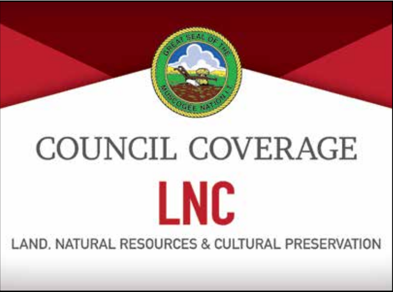
A Muscogee (Creek) Nation National Council Land, Natural Resources and Cultural Preservation Committee meeting was held March 22 at the Mound building in Okmulgee.