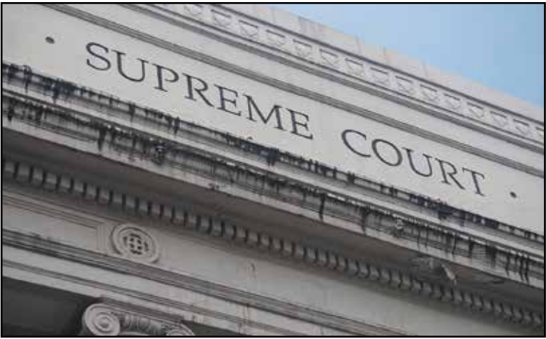
Muscogee Nation Office of the Attorney General submitted an amicus brief in support of denying the case writ of certiorari back in November 2021 when the case started seeking SCOTUS opinion.