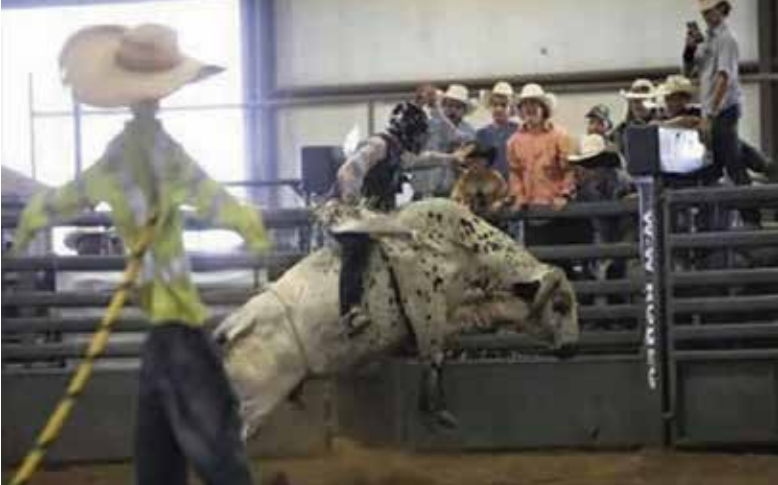
The Fisher Bash 2022 will be held on April 30 at the CrossBar Arena in Mounds, OK. (Submission)

with the addition of $1,500. “We will have a live auction at 5:30 p.m. and a silent auction will run all day,” Mandi said. “We will have open bull-riding at 6 p.m. with added money of $3,500.” Four championship buckles for the 4D, 3D, 2D and 1D winners of the Open Barrel Race, with 80% payout and added money will be given out. One championship buckle for the winner of the bull-riding with 100% payout and the added money will be handed out. There will be merchandise vendors and food vendors set up. Entry fees for exhibition barrels is $4 each or $10 for three runs, young guns (12 years and under) is $20, open barrels is $25 plus a $10 administrative fee for each racer and open bulls is $85. The Fisher Bash benefit will take place on April 30 at the Cross-Bar Arena at 5270 W. 171st St. So. Mounds, OK. The family is still looking for sponsorships, the sponsorship levels determine what type of advertising the business receives. All sponsors will receive social media promotion and be listed as sponsors on event program. The premier platinum is priced