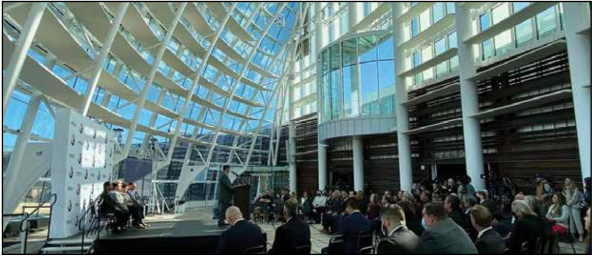
The press conference to address tribal nations impact in Oklahoma was held at the First American Museum in OKC.