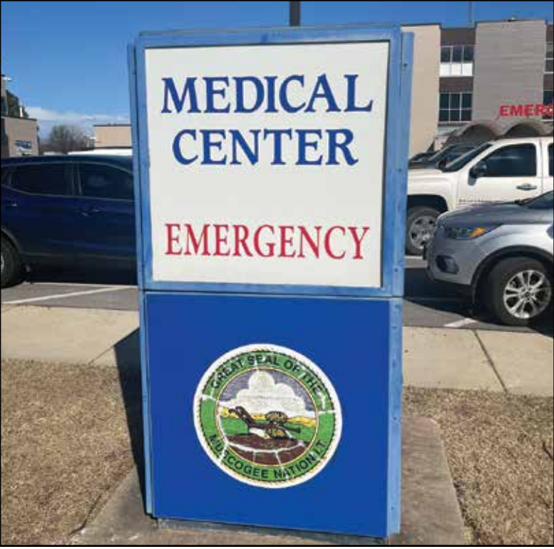
The Muscogee (Creek) Nation Medical Center 1212 S. Belmont Okmulgee, OK.