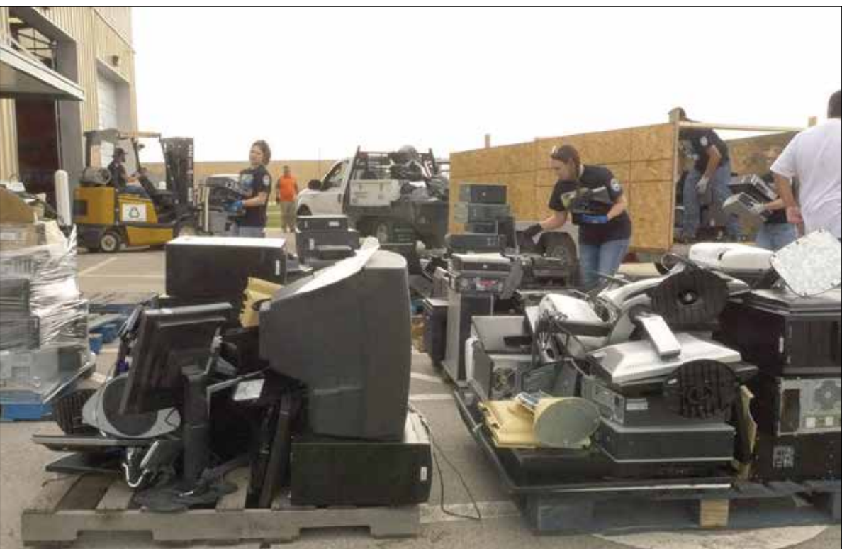
Environmental Services took in used electronic devices.

made by SCOTUS reaffirming reservation status for MCN that has since expanded to other tribal nations, including Cherokee Nation. Oklahoma Governor Kevin Stitt has been publicly vocal about his opposition to the decision. News reports from the nation’s capital expect a decision by the end of June.