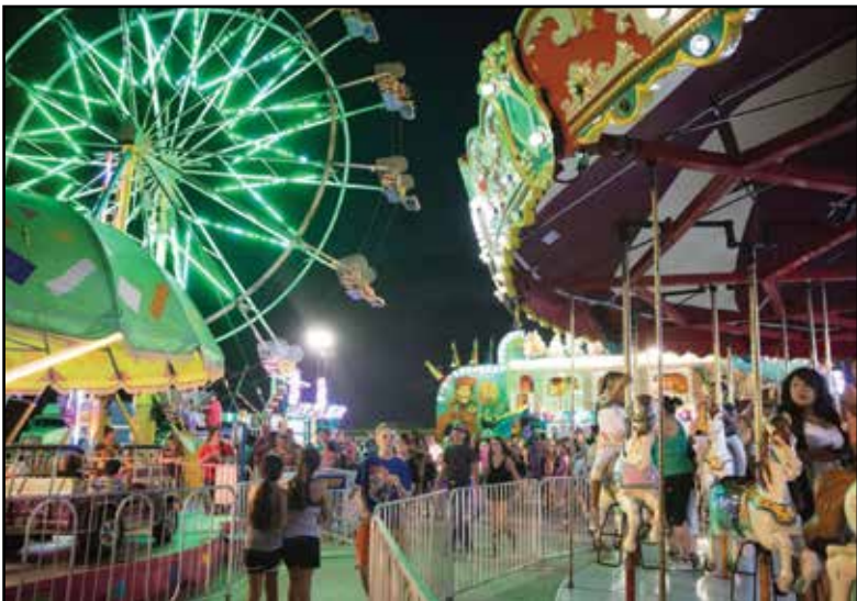
Muscogee Nation Festival is projected to attract around 40,000 visitors (Submission)