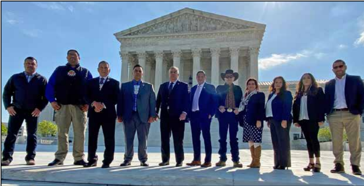
Delegation from the Muscogee Nation along with various tribal leaders from the state on Montana outside of the United States Supreme Court building.