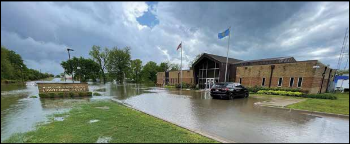
The MCN Lighthouse Police Department building received damage from flood waters.