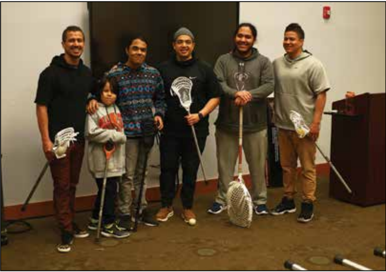
Muscogee students meet with professional lacrosse players at the College of the Muscogee (Creek) Nation.