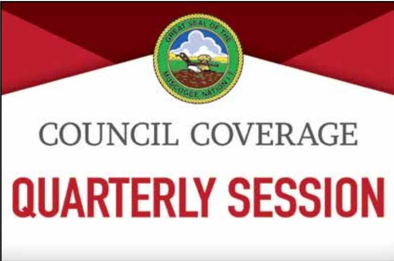
A Muscogee (Creek) Nation National Council Quarterly Session was held April 30 at the Mound Building in Okmulgee.