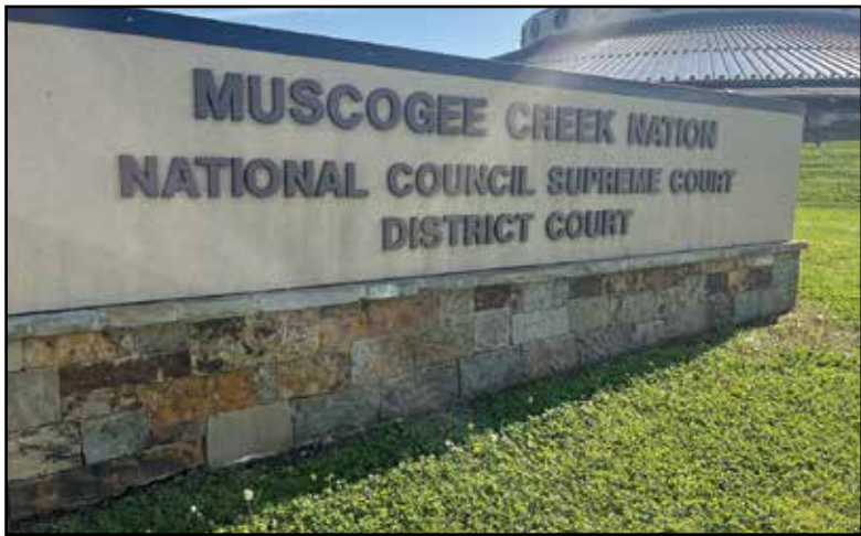
MCN will use laws in place by other entities to prosecute when necessary.