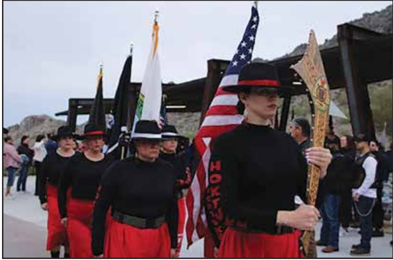
The Mvskoke Nations Women Honor Guard presents the colors at the Piestewa Challenge event.

THE MVSKOKE NATION WOMEN'S HONOR GUARD REPRESENTED MCN IN ARIZONA