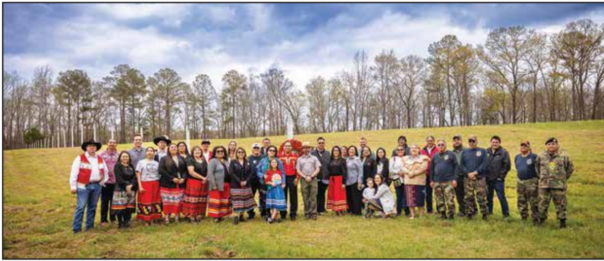
MCN dignitaries, employees, and legislators commemorate the 210th Battle of Horseshoe Bend.

COMMEMORATION MARKED WITH WORDS OF UNITY AND STRENGTH