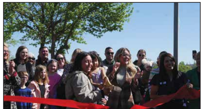
A ribbon cutting ceremony for the newly opened Riverwalk playground happened on Thursday, April 4.

8 FT. EXTRA-WIDE SLIDE ALREADY A POPULAR FEATURE