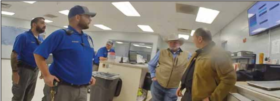
In December of 2023 Okmulgee Jail Officials and Muscogee (Creek) Nation Lighthorse Police were involved in a physical altercation over a booking proceeding involving a non-tribal citizen for drug possession.

MATTHEW DOUGLAS' ARRAIGNMENT IN TRIBAL COURT POSTPONED BY STAY