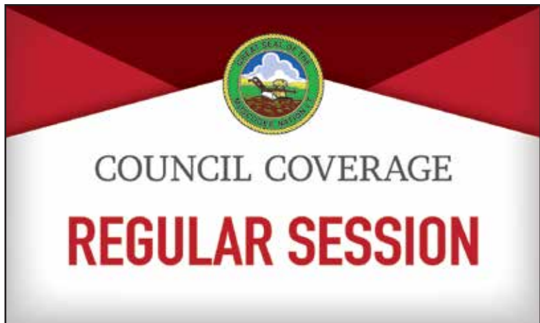
The Muscogee Creek National Council held a regular session in person on March 30.

INCREASES FOR ASSISTANCE, GRANTS AND PROGRAMS FOR MVSKOKE CEREMONIAL GROUNDS AND CHURCHES ADOPTED