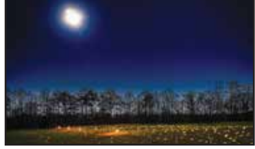
The site of Horseshoe Bend is commemorated by luminaries set on the ground at night.