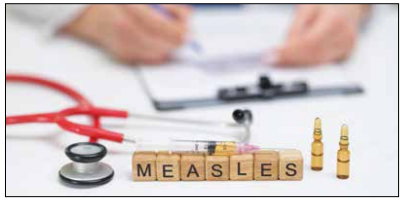
Two cases of measles have been reported in Oklahoma by the state health department.

COUNCIL HOUSE COLLECTIONS CONTINUED ON PAGE 2