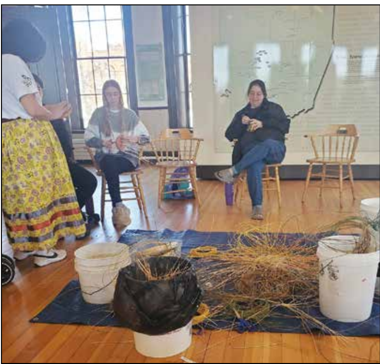
Students learn how to weave baskets at the Council House during spring break activities.