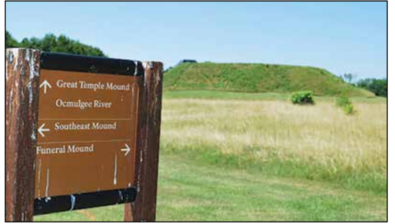
A sign gives directions to one of the mounds in Ocmulgee Mounds National Historic Park.

The full performance of "The Sound of the Council Oak" can be found on Mvskoke Media's youtube page.