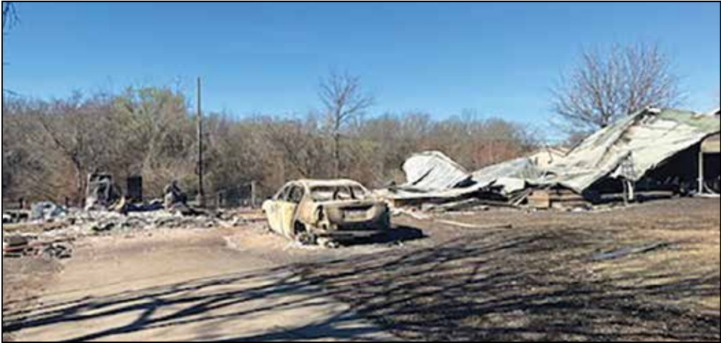
The remains of a car damaged in the March 14 Oklahoma wildfires sits charred in front of a damaged house.