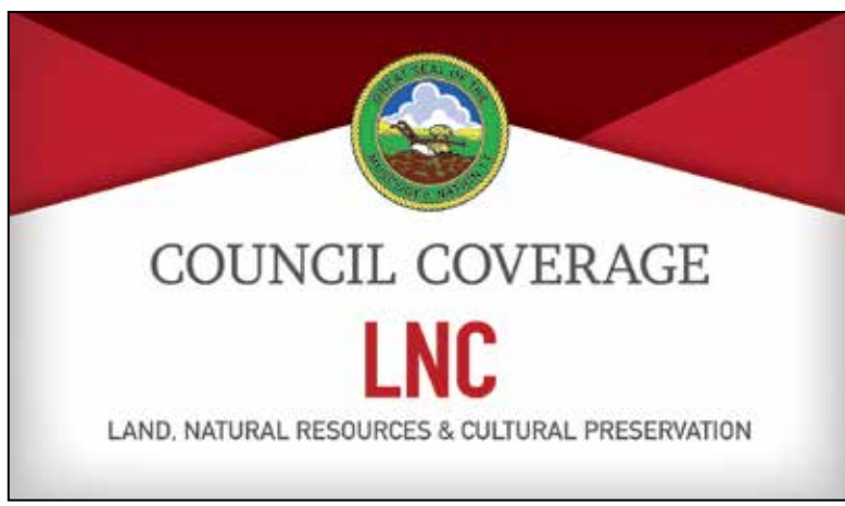
A Muscogee (Creek) Nation Land, Natural Resources and Cultural Preservation session was held in the Mound Building on March 11. (MM File)

To view the full agenda, visit: mcnnc.com .