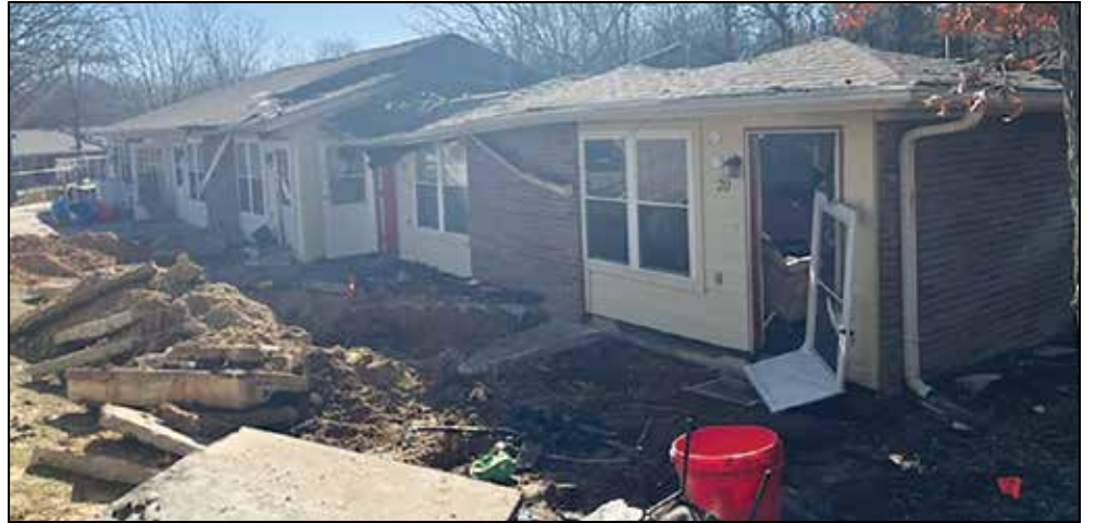
A house affected by the March 14 wildfires sustained massive damage to the roof.